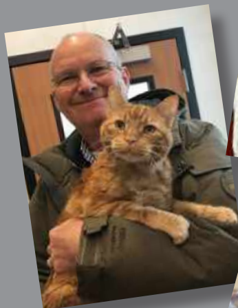
Simba, a handsome orange tabby, looks pleased & ready to say bye to PCHS.