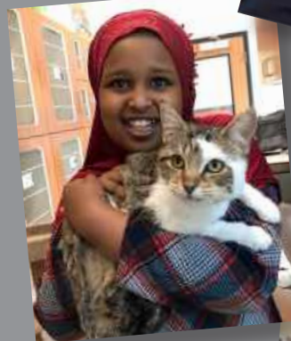
Chalupa, a stunning brown & white cat has found someone to love.