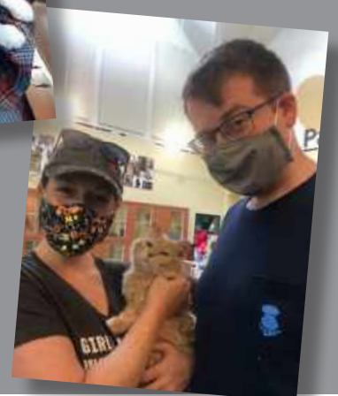
Andie, the fluffy yellow kitten looks right at home already.